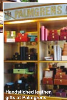
Handsticked leather gifts at Palmgrens

big names like Intercontinental, Hilton, Sheraton, Radisson SAS, First Hotels and Scandic. The newest and largest hotel to arrive, the Clarion Hotel Sign, adds a further 558 rooms to the mix, with different designers displaying their talents on each