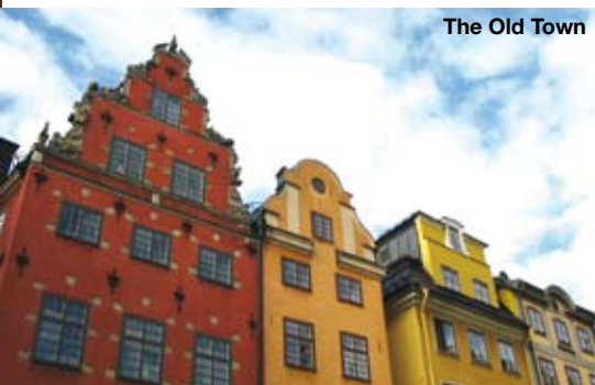
The Old Town

But the city's hoteliers are not resting on their laurels. The Stockholm Sheraton was the first for the brand in Europe, built in 1971, and was completely renovated last year. Marriott arrives in 2010, as will a new offering from Rezidor, which is opening a conference hotel with 420 rooms on the waterfront. The building will be the largest