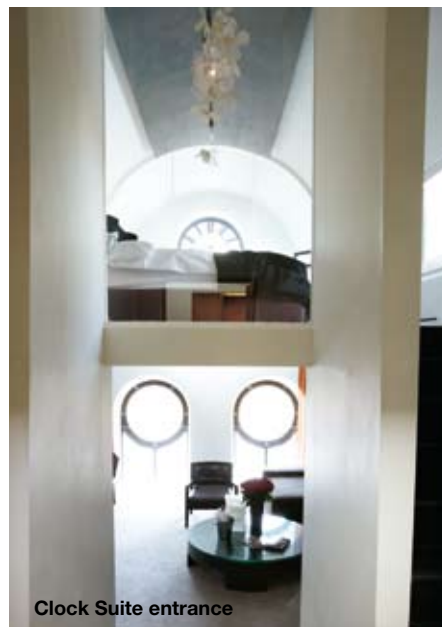
Clock Suite entrance

CONTACT Guldgrand 8; tel +46 8517 35300; or visit hilton.co.uk/stockholm .