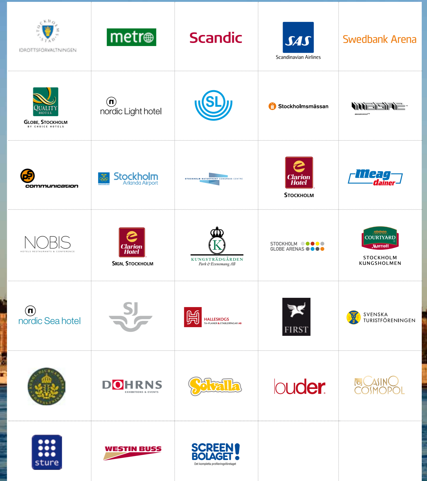
Stockholm Event Network partners. For more information www.stockholmevent.com

Stockholm Event Network evenemang@stockholm.se www.stockholmevent.com